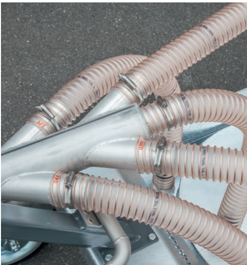
5-fold direct vacuum system